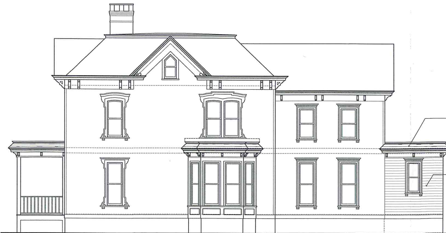
NORTH ELEVATION SCALE: 1/4" = 1'-0"