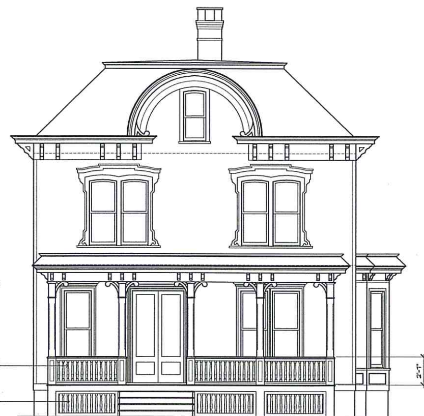
EAST ELEVATION SCALE: 1/4" = 1'-0"