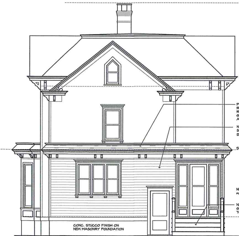
WEST ELEVATION SCALE: 1/4" = 1'-0"