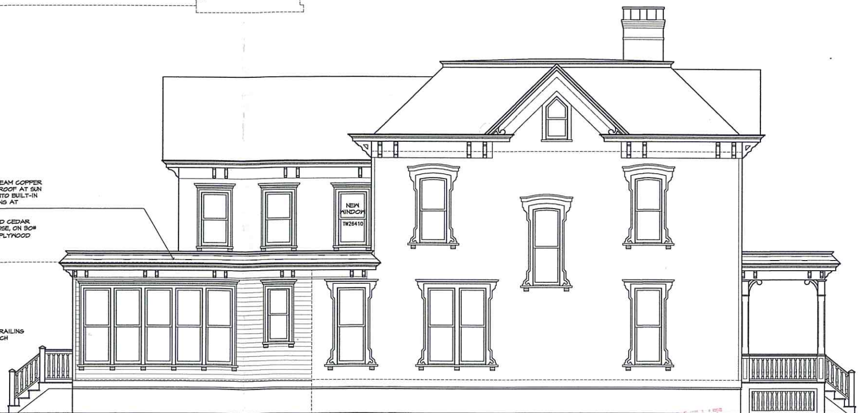
SOUTH ELEVATION SCALE: 1/4" = 1'-0"