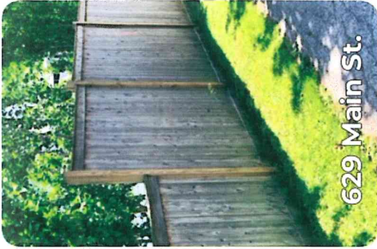
629 Main St.