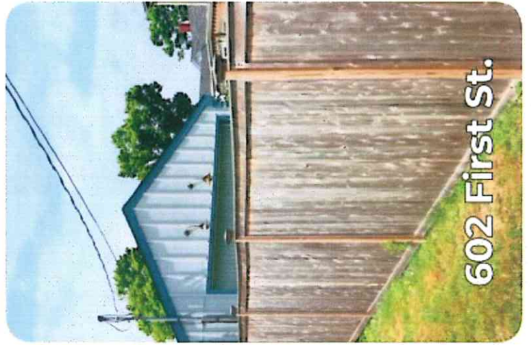
602 First St.