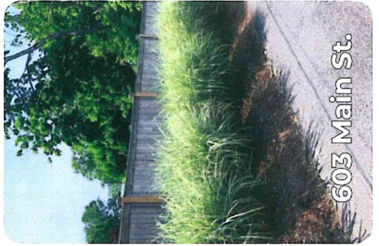
603 Main St.