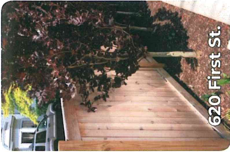
620 First St.