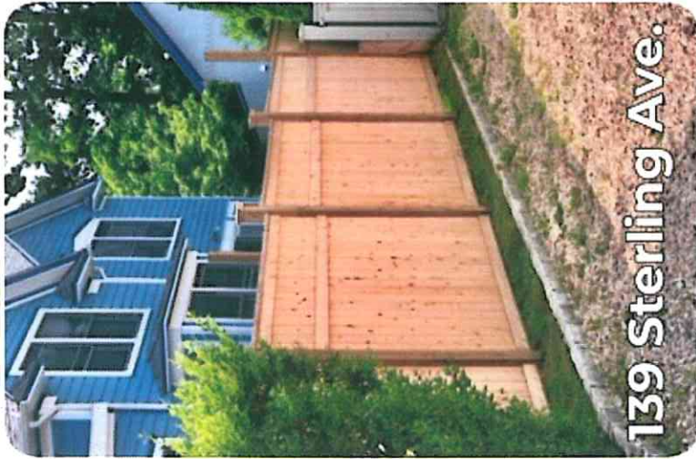
139 Sterling Ave.