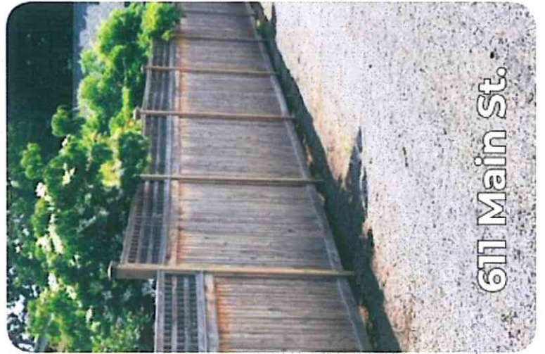
611 Main St.