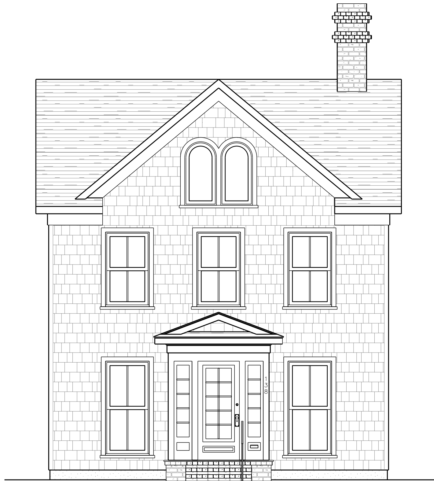
EXISTING FRONT ELEVATION SCALE: 1/4" = 1'-0"