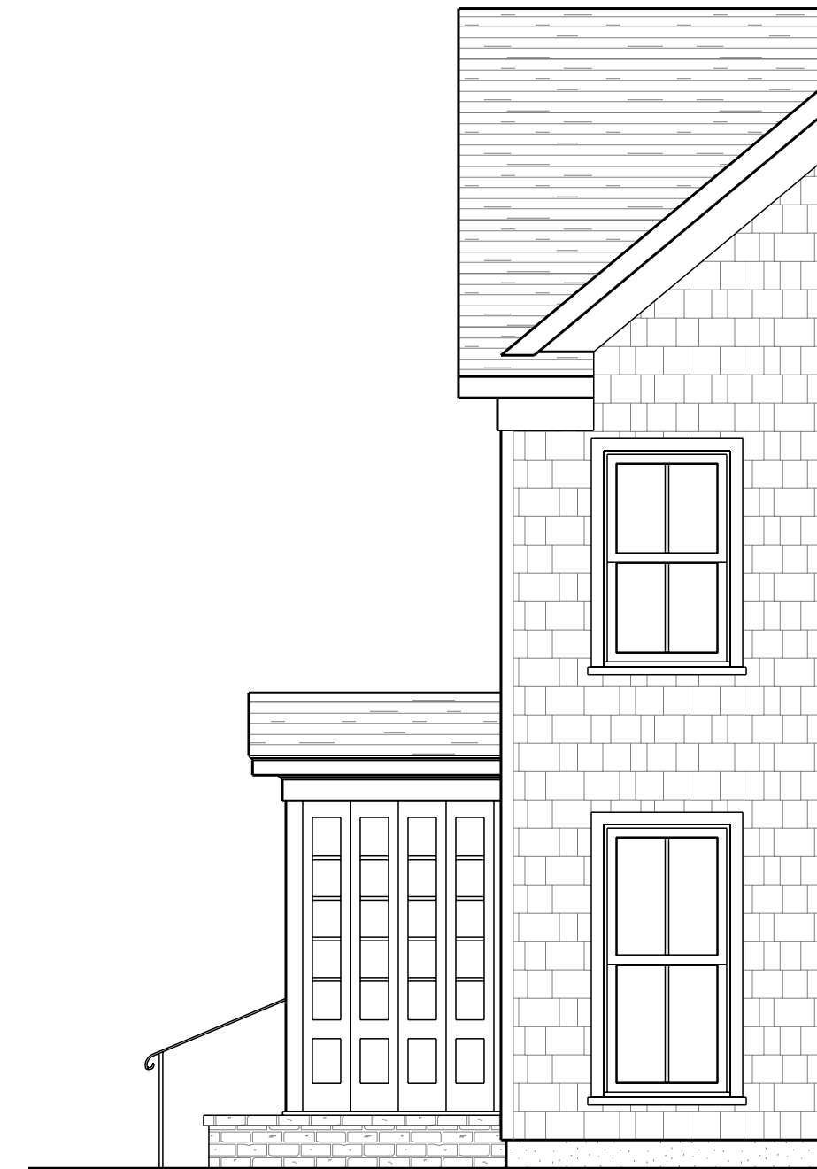
PROPOSED RIGHT ELEVATION SCALE: 1/4" = 1'-0"