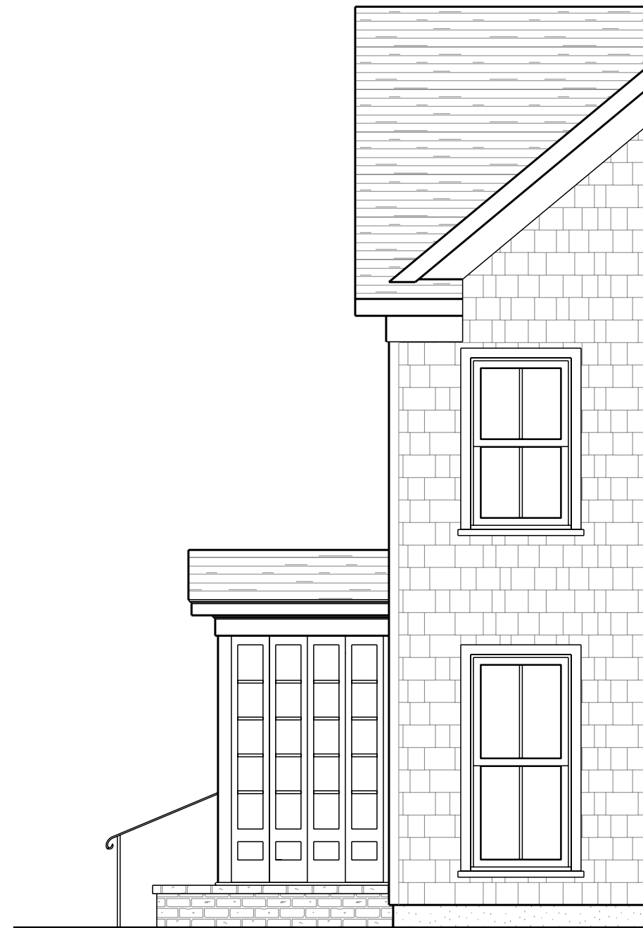
EXISTING RIGHT ELEVATION SCALE: 1/4" = 1'-0"