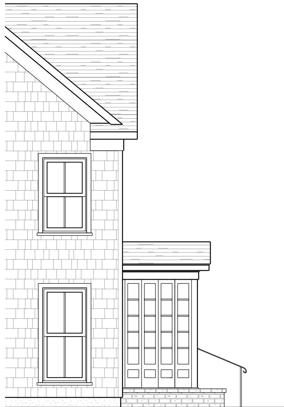
EXISTING LEFT ELEVATION SCALE: 1/4" = 1'-0"