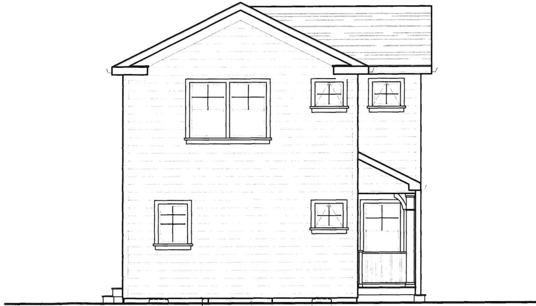
PROPOSED LEFT ELEVATION