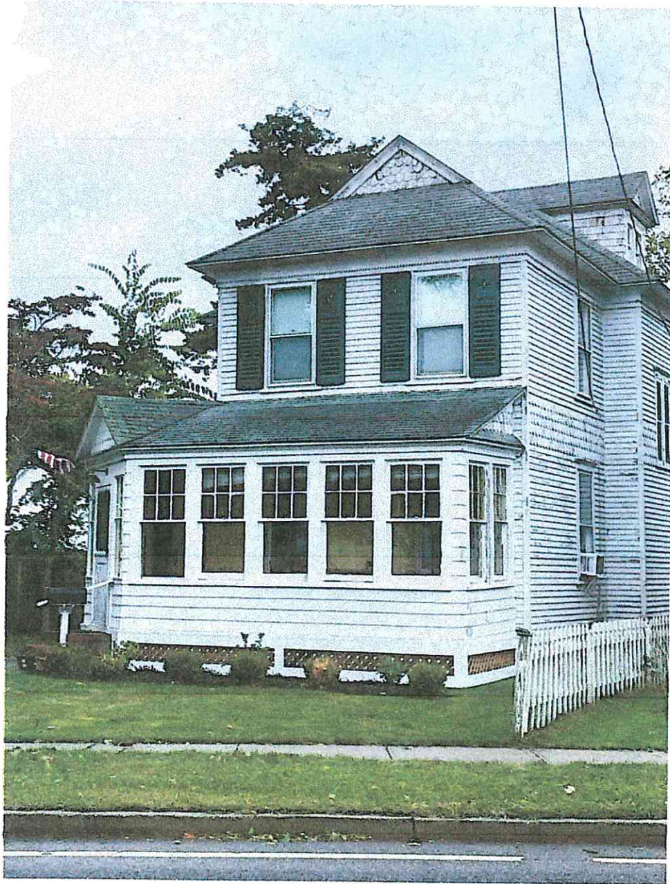
721 MAIN STREET FRONT VIEW - EXISTING