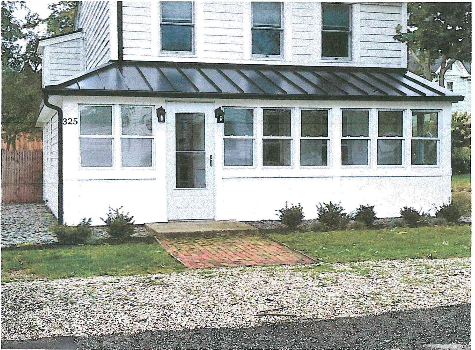
SAMPLE of PORCH ROOF